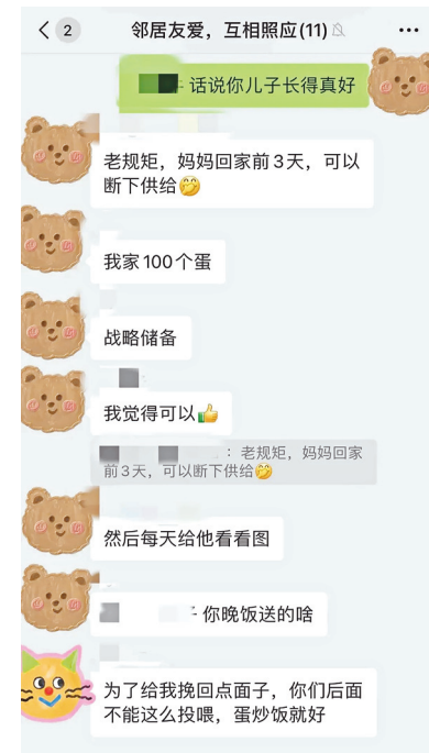
The chat history shows neighbors engaged in heated discussion over how to better feed Youyou.